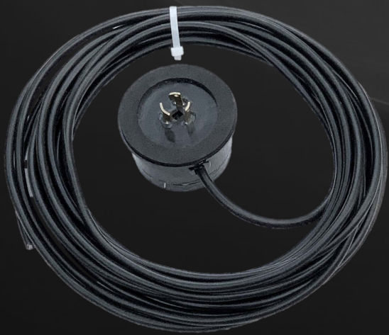
RD-TX-LAC TX rapid deployment lamp post power adaptor