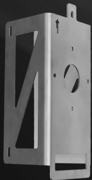
RD-TX-LMP TX rapid deployment bracket lamp post claim (included with RD-TX-BRKT)