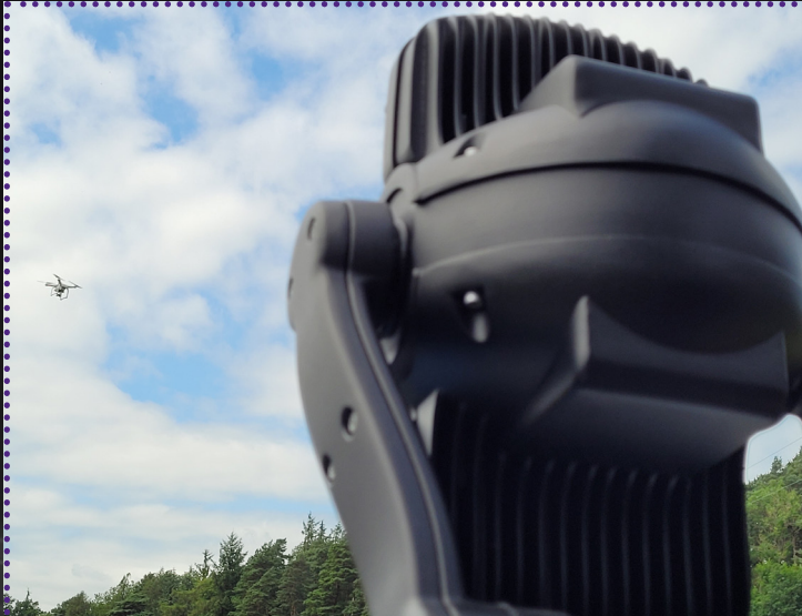
Predator Skyview360 camera in action