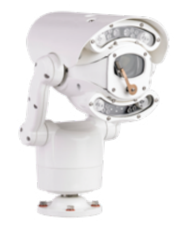
360 Predator Ultra with PTZ and Wiper