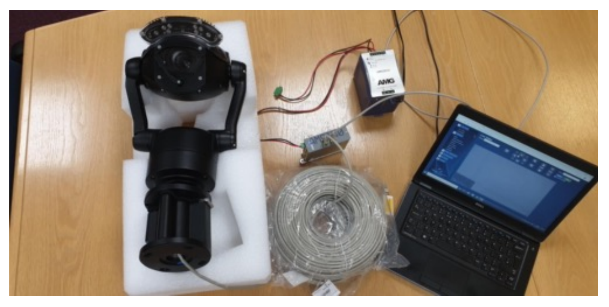
AMG150-2GBT-P180 with AMG2012 and 360 Predator with long-range infrared lighting

The above image shows the camera set up on the bench. With the Infrared lights on and forcing the wiper and PTZ controls to make the camera consume maximum power and test the PoE to its limit.