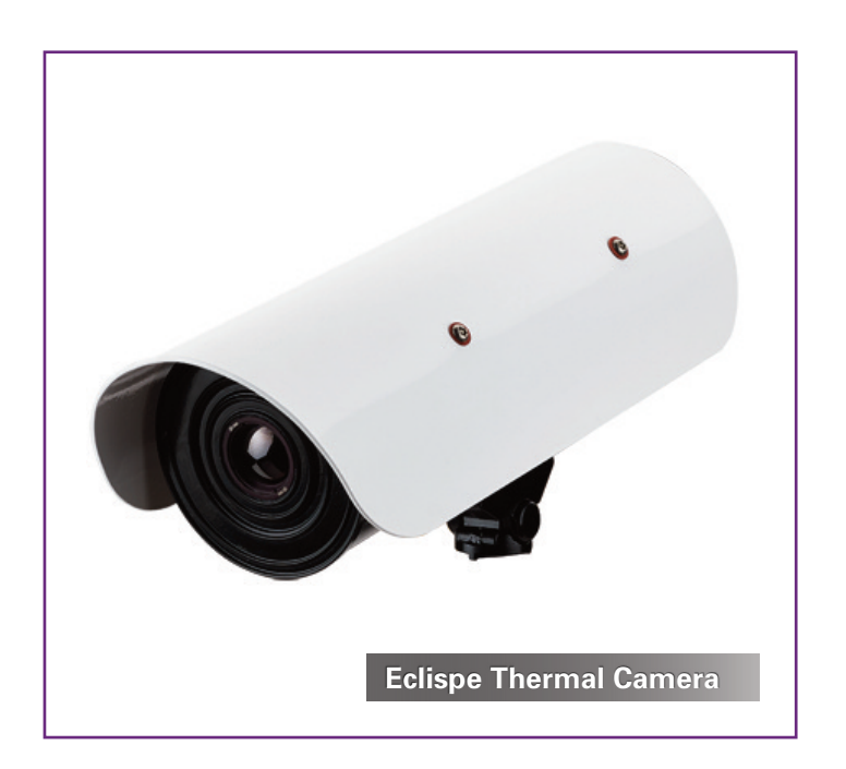
The 360 Vision Technology Eclipse Thermal Static Camera is an IP67 rated IP thermal imaging

After testing the capabilities of the 360 Vision Technology Eclipse Thermal Static Camera onsite, the project was specified to include a mix of Eclipse Thermal Static Cameras to compliment a network of standard HD cameras (for use during daylight hours).