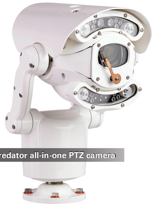
Predator all-in-one PTZ camera

Security Level 3 approved primary detection system, for operational alert use in sterile zone monitoring applications (2009). Issued by the Home Office Centre for Applied Science and Technology (formerly CPNI), this certifies the DAVANTIS video analytics solution for sole source use for detection at Government facilities. The DAVANTIS product has also received Secured by Design (SBD) Accreditation, meeting both the Police Approved Standards and Police Preferred Specification.