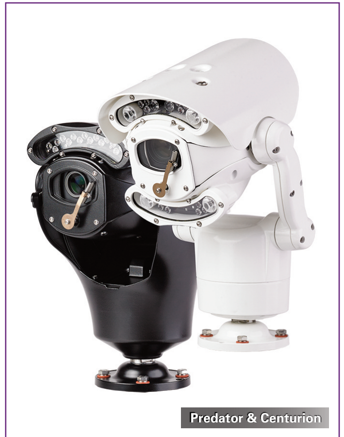
Predator & Centurion